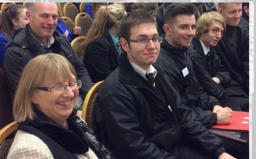
St Mary's CBGS, Belfast