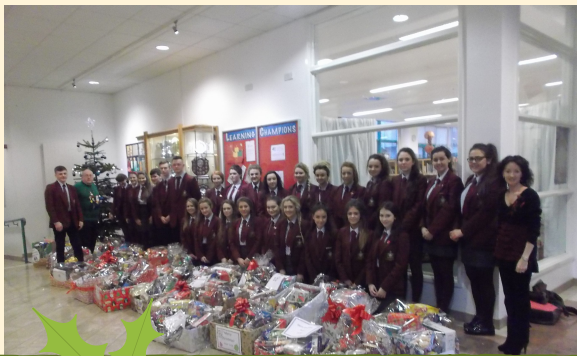
St Patrick's HS, Keady

Well done to all of our form classes in St. Patrick's High School for their response to the annual St. Vincent de Paul Christmas Food Hamper Appeal. Staff and students have generously donated hampers full of festive food and gifts.