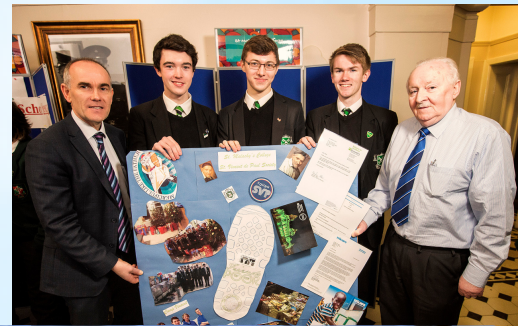
St Malachy's, Belfast