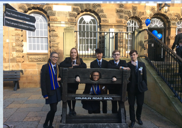
St Columbanus, Bangor