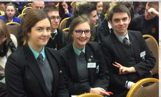
St Ciaran's, Ballygawley