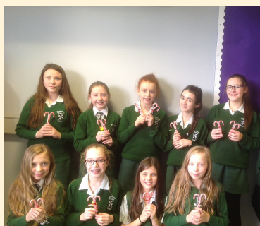
Dominican College, Fortwilliam