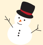
St Joseph's HS, Newry

Members of the Young St. Vincent de Paul conference presented 75 Christmas Hampers to St Bridget's SVP to help local families over the Christmas holidays. The school would like to pass on their thanks to the school community for supporting this appeal and to the parents of our pupils for their continued positive support.