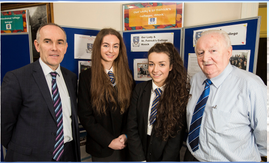
Our Lady & St Patrick's, Knock