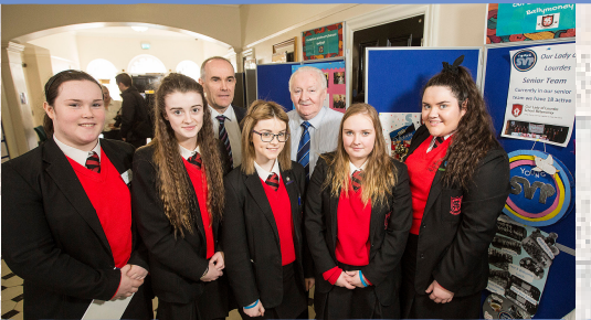
Our Lady of Lourdes, Ballymoney