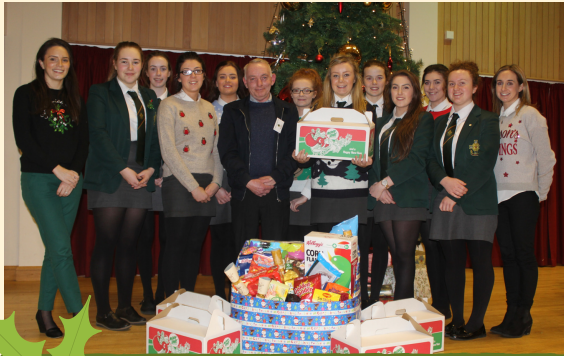
St Malachy's HS, Castlewellan