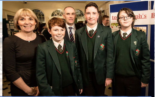
St Joseph's HS, Newry