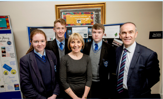
St Patrick's College, Maghera