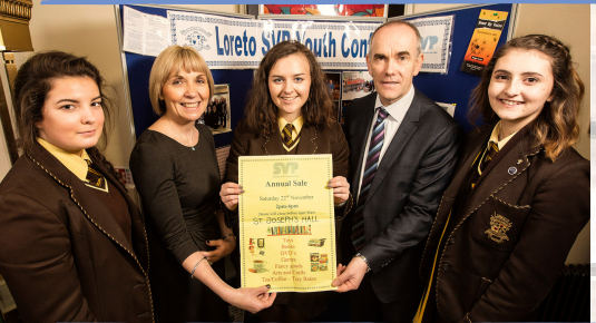
Loreto Grammar, Omagh