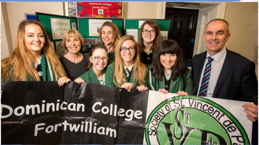
Dominican College, Fortwilliam