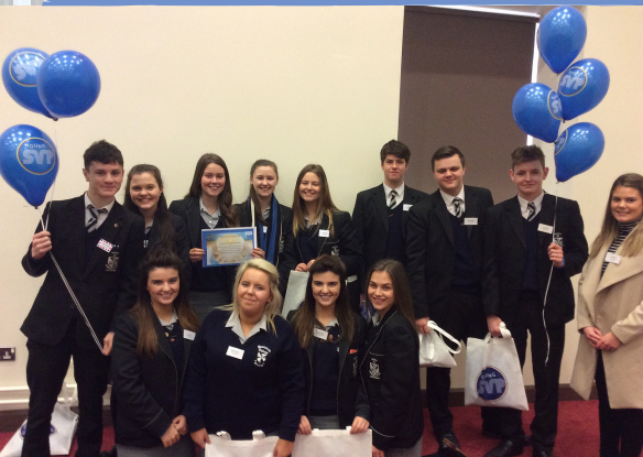
Dominican College, Portstewart