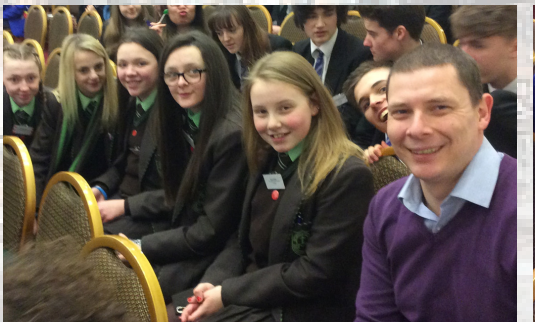
St Louise's College, Belfast