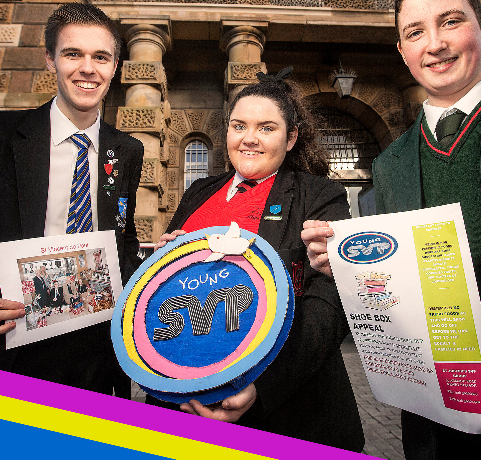
St Vincent de Paul