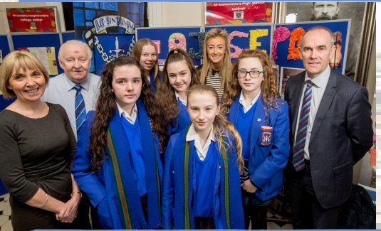
St Genevieve's HS, Belfast