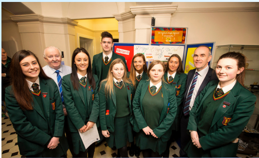
St Mary's HS, Limavady